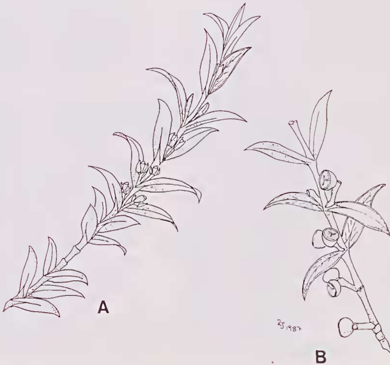
Fig. 1. Eucalyptus recurva Crisp. A, branchlet with developing buds (x 0.9). B, branchlet with fruit (x 0.9). (Both from life; R. Jean del.)

Even in the absence of external threats, the single known population of E. recurva must be endangered by its extremely narrow genetic base. Estimates of the number of individuals necessary to maintain a viable population vary widely (Fisher 1978, Ellyard 1987 and references cited in these), but by any standard, five may be too few. In fact, there is evidence that E. recurva is suffering the effects of inbreeding. Very few seeds are set (about one per capsule), and a good proportion of those appear to lack embryos. Attempts by M.A. Clements to germinate seed at the Australian National Botanic Gardens have met limited success. After stratification, seven out of ten seeds germinated but only one established a seedling. The survivor struggled to produce three pairs of leaves over several months, and then died. Subsequently, another batch of seed treated similarly produced a single seedling which grew slowly, reaching 10 cm in height after four months (Fig. 2F). The lack of seedling vigour suggests that a post-zygotic lethality system may be operating in this taxon.